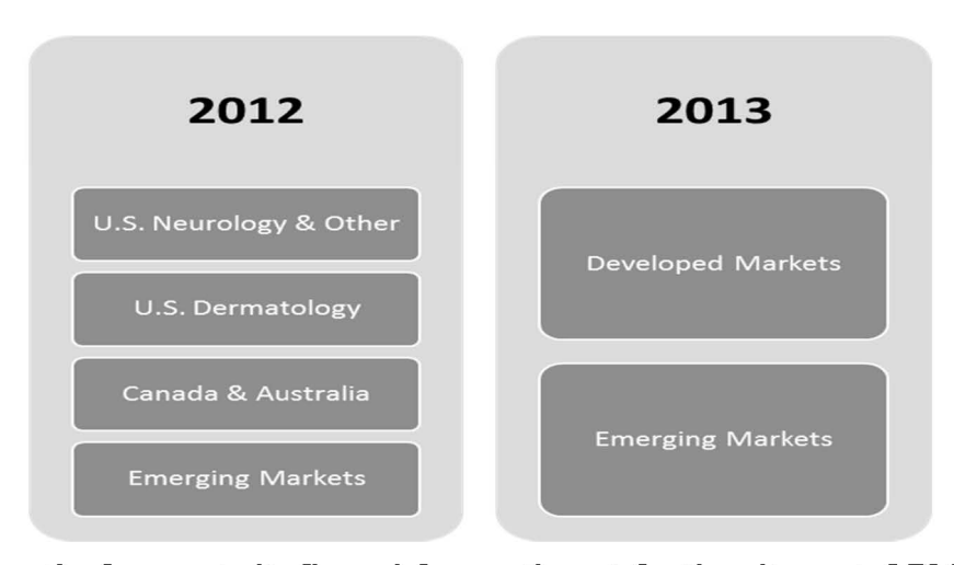
Figure 1. Valeant's changes to its financial reporting at the time it created Philidor.

a few main products, the public could previously track how those products were performing. But with just two operating segments, it became impossible for the public to obtain that same information.